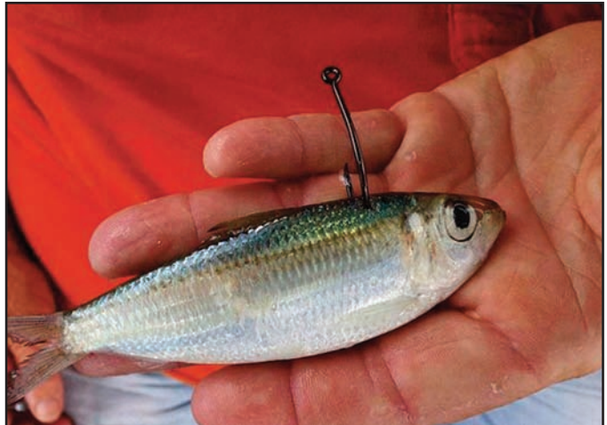
Hooking a bait in front of its dorsal generates action, and the aft placement nabs "short-striking" fish