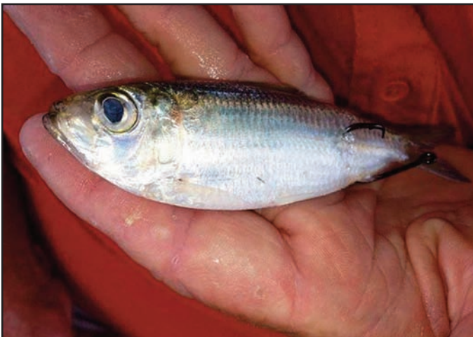
A bait hooked near its anal fin is a great way to make baits swim away from a stationary platform, like a pier, jetty, bridge, beach or shoreline.