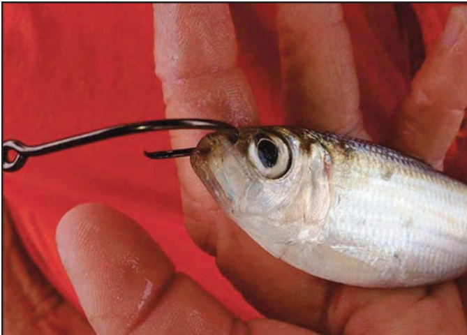
Nostril hooking is ideal for surface live-baiting.

Here are some different ways you can hook a sardine. By placing the hook in a certain part of the baitfish you can make him swim in a certain way.