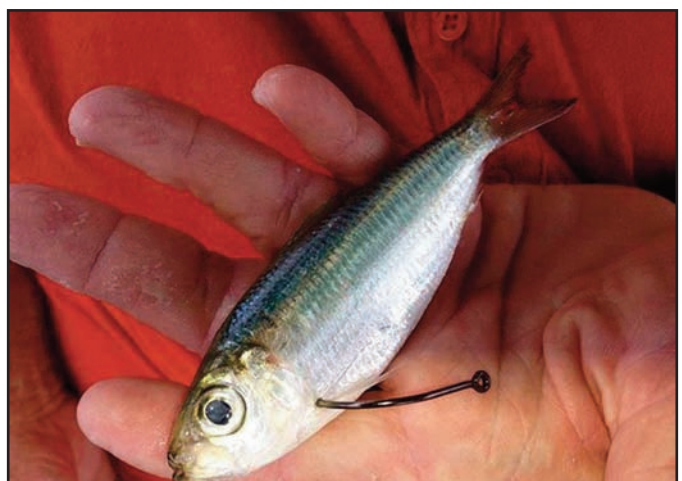
Throat hooking forces a bait into the depths, perfect for midlevel fish.